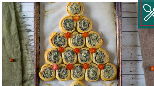
Puff pastry pinwheels are a great appetizer especially during the Christmas season, you can arrange them to form a Christmas tree.

What gets wetter the more it dries? A towel.