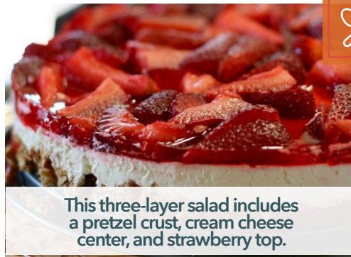
This three-layer salad includes a pretzel crust, cream cheese center, and strawberry top.